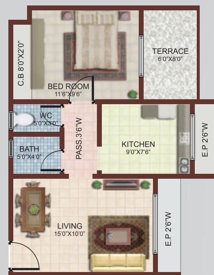
1 st , 3 rd , 5 th , 7 th , 9 th & 11 th FLOOR PLANS