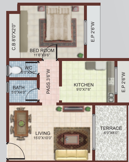
2 nd , 4 th , 6 th , 8 th , 10 th & 12 th FLOOR PLANS

The most we value at Happy Homes is the importance of family. In all our projects we provide is the optimum utilization of space with lifestyle comforts be it the layout of complex or in our space efficient apartments.